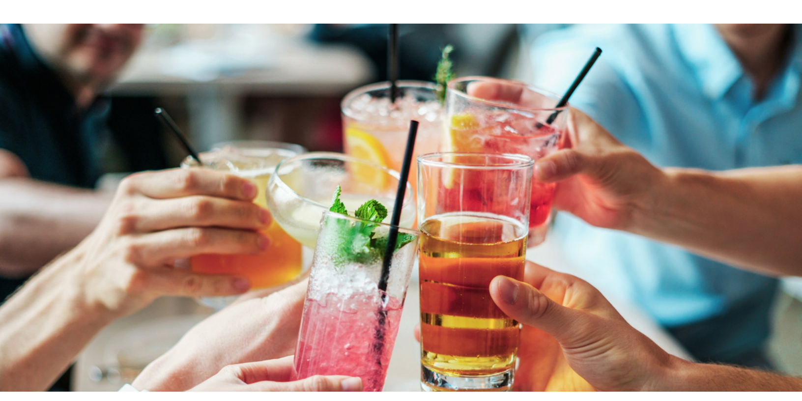
*All Food and Beverage must be purchased through Reston National. Plus 20% Tax and 20% Service Charge. Pricing and availability are subject to change at anytime. Special requests for items not listed are welcomed, and prices will vary accordingly.